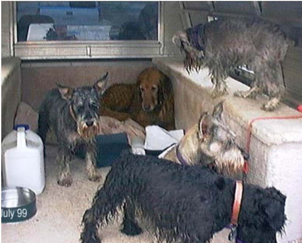
But then out-of-towners started showing up - and even dogs from out-of-state!